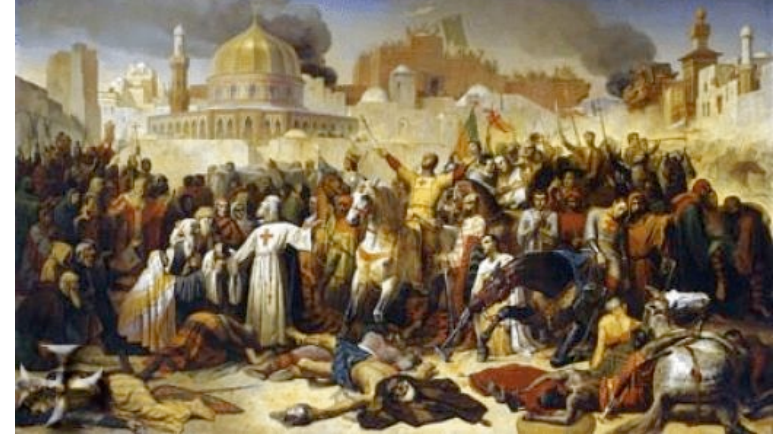
Artwork depicting the "triumphant" siege of Jerusalem during the 1st Crusade

The crusaders went to Jerusalem with one main goal in mind -- to take control of the Holy Land back from the Muslims. Despite many attempts, this goal was never reached. Small Christian states were established for a time in and around Jerusalem, but they soon returned to Muslim control.