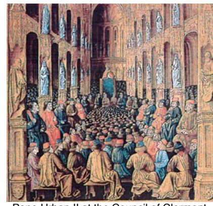
Pope Urban II at the Council of Clermont

Sepulchre in Jerusalem commemorated the hill of crucifixion and the tomb of Christ's burial and was visited by Pilgrims. In 1009, the Muslim leader al-Hakim ordered the destruction of the Church of the Holy Sepulchre. In 1039 his successor, after requiring large sums be paid for the right, permitted the Byzantine Empire to rebuild it. Pilgrimages were allowed to the Holy Lands before and after the Sepulchre was rebuilt, but for a time pilgrims were captured and some of the clergy were killed. The Muslim conquerors eventually realized that the wealth of Jerusalem came from the pilgrims; with this realization the persecution of pilgrims stopped. However, the damage was already done, and the violence of the Muslims in Jerusalem became part of the concern that spread the passion for the Crusades.