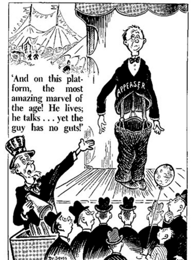
The Great U. S. Sideshow

What do these political cartoons suggest about the US position in the 1930s?