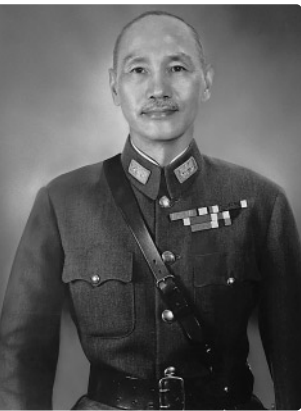
▲ Jiang Jieshi and the Nationalist forces united China under one government in 1928.

The Long March In 1933, Jiang gathered an army of at least 700,000 men. Jiang's army then surrounded the Communists' mountain stronghold. Outnumbered, the