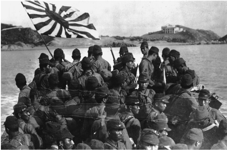
▲ A Japanese landing party approaches the Chinese mainland. The invasion forced Mao and Jiang to join forces to fight the Japanese.

Communist Party leaders realized that they faced defeat. In a daring move, 100,000 Communist forces fled. They began a hazardous, 6,000-mile-long journey called the Long March . Between 1934 and 1935, the Communists kept only a step ahead of Jiang’s forces. Thousands died from hunger, cold, exposure, and battle wounds.