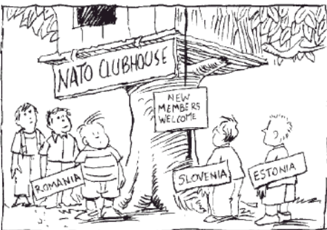
Source: Henry Brun, The World Today: Current Problems and Their Origins , 2005